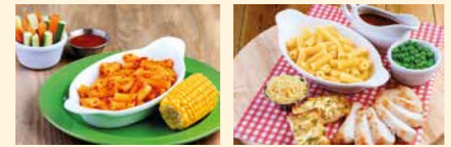
Pasta in tomato sauce Build your own pasta with sliced chicken fillet

PLUS CHOOSE ONE VEGGIE OR SIDE FROM THE PICK 'N' MIX SECTION