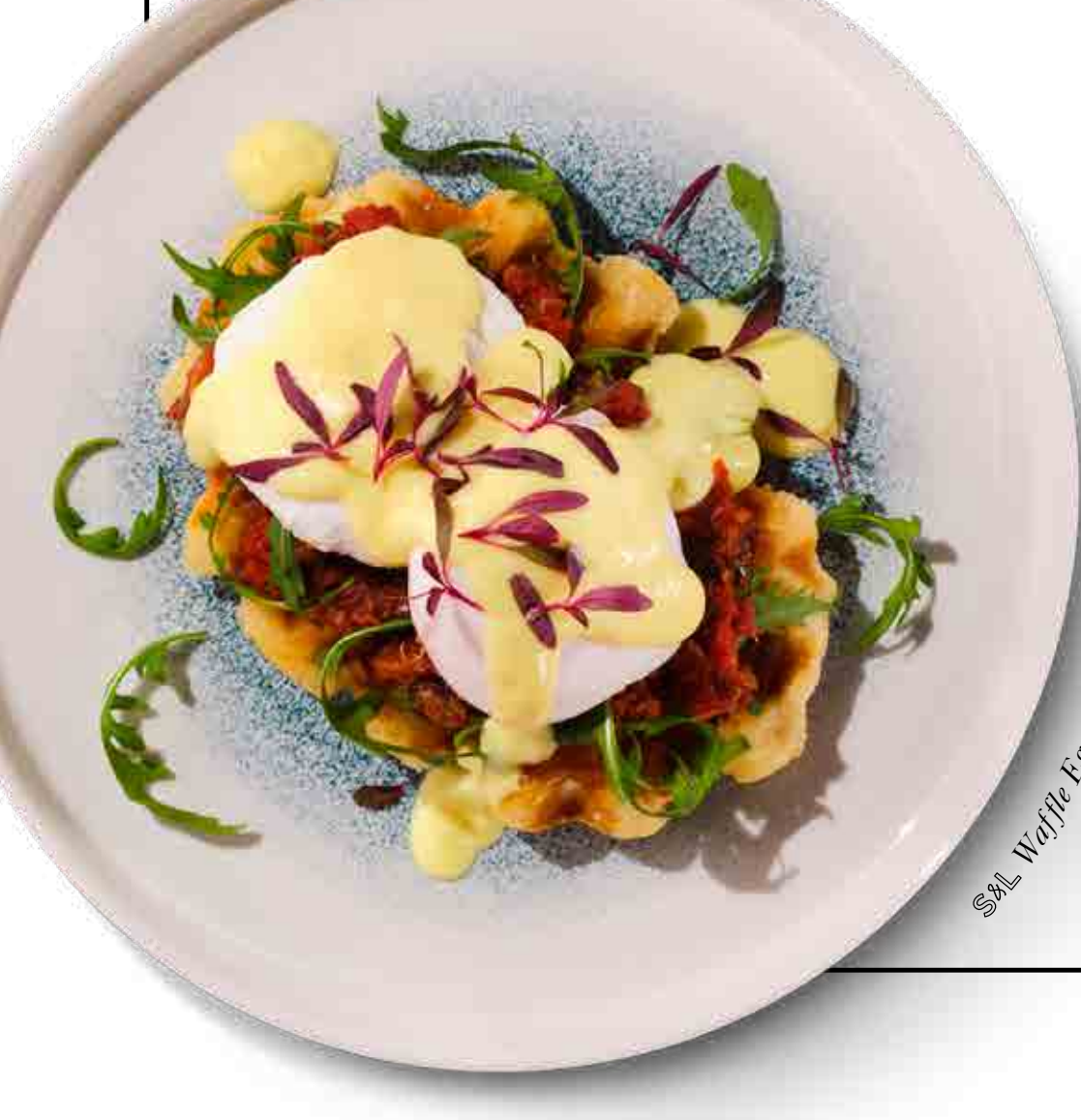
S&L Waffle Eggs