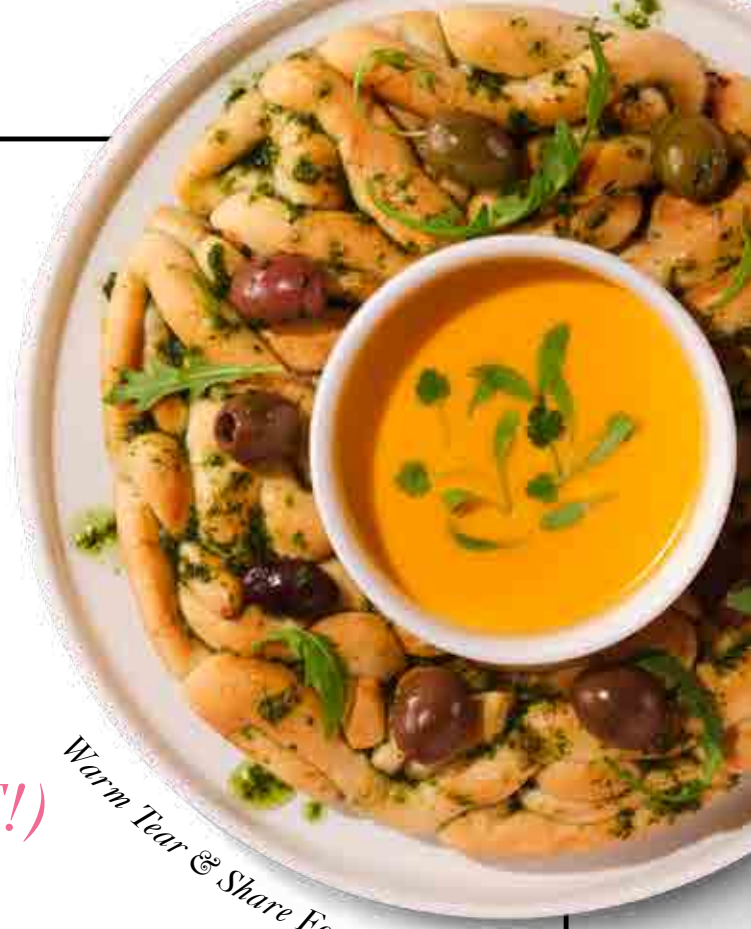
Warm Tear & Share Focaccia Bread

GRAB A PLATE AS A QUICK SNACK OR MIX THEM UP FOR A MEAL. WE RECOMMEND 3 PER PERSON. PERFECT FOR SHARING (OR NOT!)