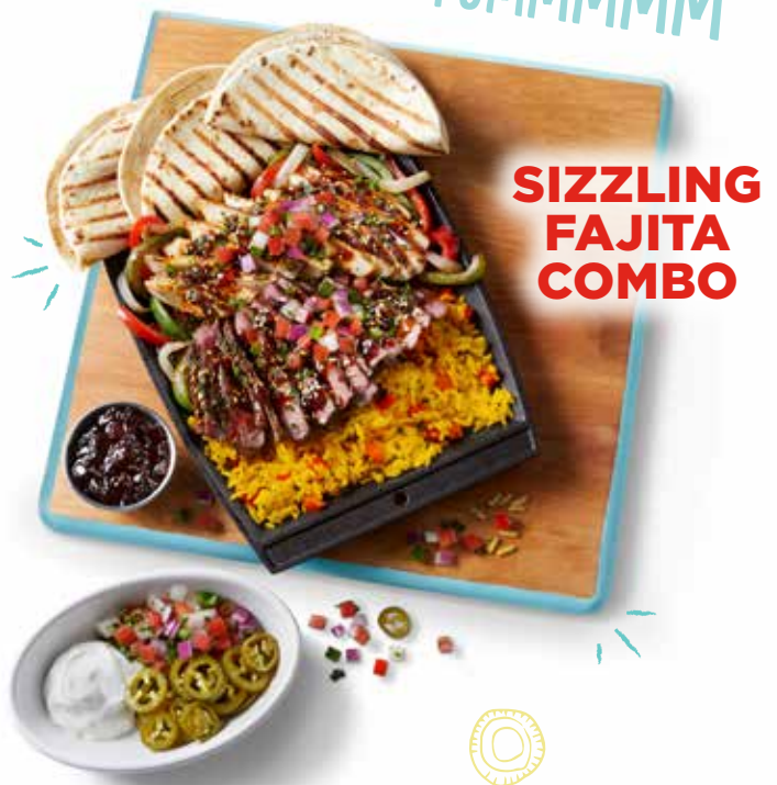
SIZZLING FAJITA COMBO

SOUP OF THE DAY KD 1.950 Discover the perfect soup to pair with your visit today! Ask our staff for more details.