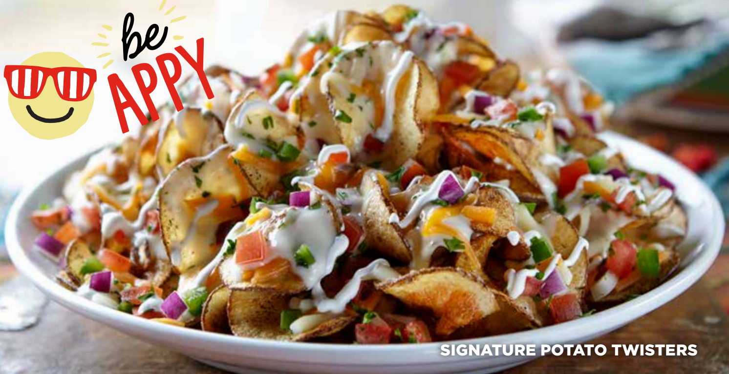
SIGNATURE POTATO TWISTERS