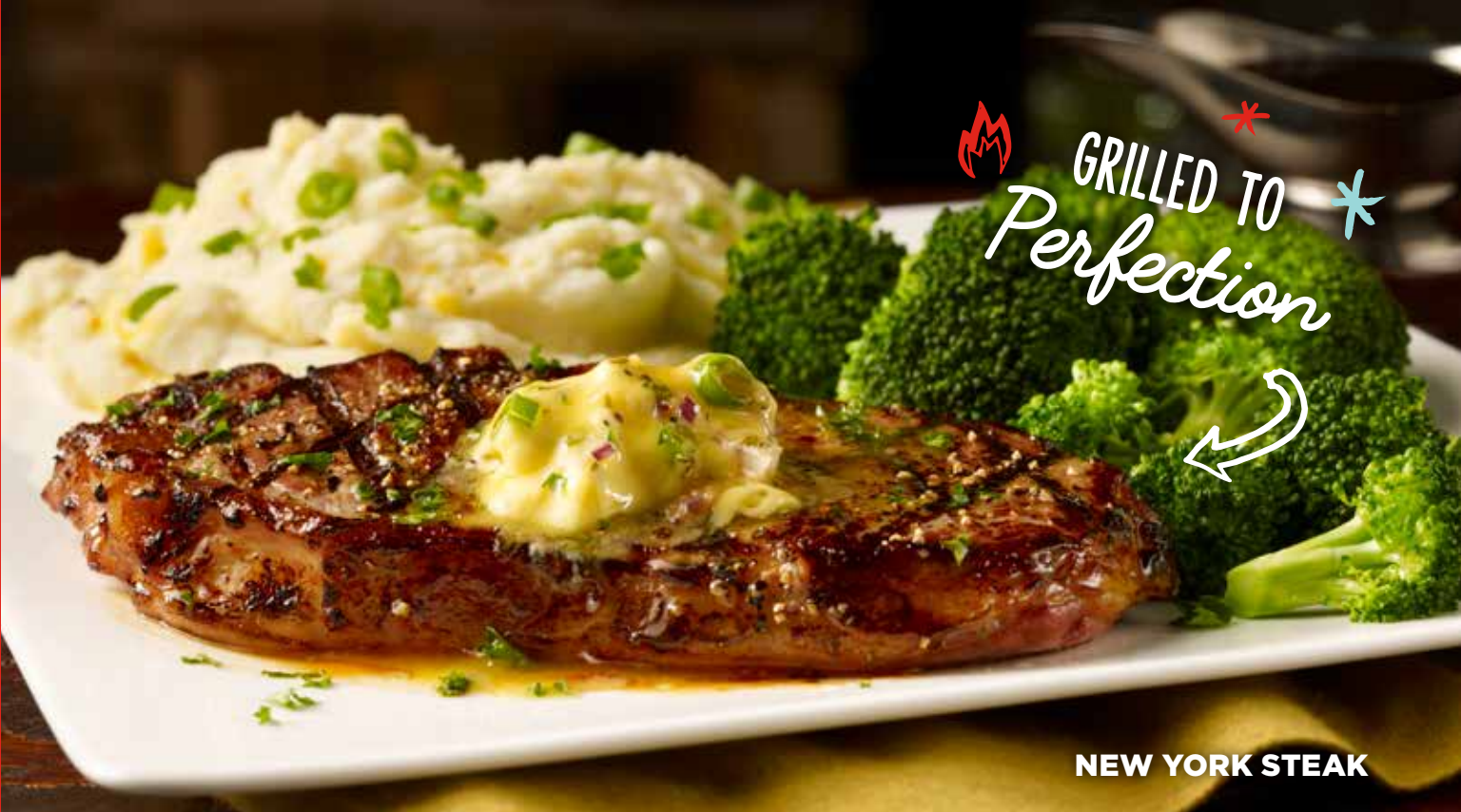
NEW YORK STEAK